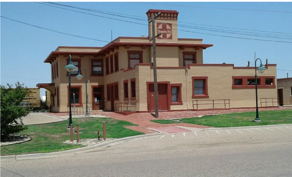
This is a former Harvey House, now a B&B in Slaton, TX on BNSF (ex-ATSF) near Lubbock, TX.