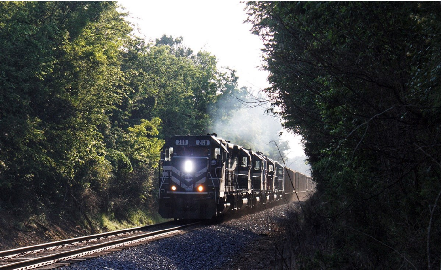
Honorable Mention, May 2019, West Kentucky NRHS Photo Contest - A Paducah and Louisville railway coal train heads north through Princeton, KY on its way to Warrior Coal in Madisonville.