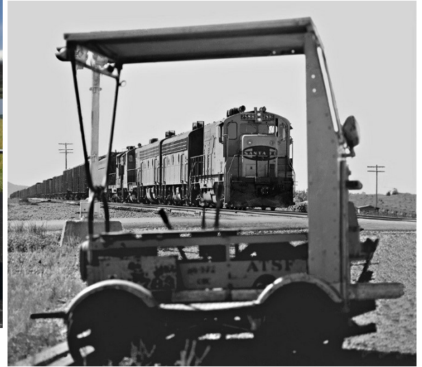
Above: This is a Jack Delano photograph from the Internet, taken sometime in the 60s on the Santa Fe line. The hand car is significant. We believe it to be a Fairmont M-9 series. Standby, you will learn more later!